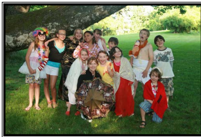
Some 2008 participants enjoying in "Fasching" or Carnival.